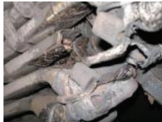
Figure 6: Endwinding vibration leading to copper fatigue cracking and current interruption at full load.

In our experience none of these problems will occur if there are no natural frequencies (at operating temperatures) near a forcing frequency on a relatively new machine. However, with long-term thermal aging, the support system (or its components) may loosen and fretting may occur. Similarly, as mentioned above, a high current transient may also loosen the support structure and result in vibration.