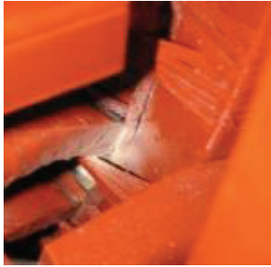
Figure 1: Winding bar insulation abrasion at support ring