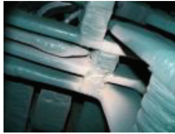
Figure 2: Insulation abrasion (dusting) at circuit rings