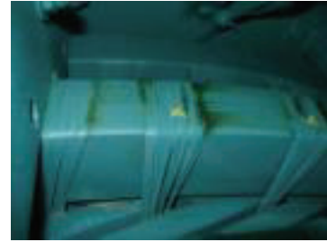
Figure 3: Greasing, due to a mix of insulation dust and oil at insulation abrasion locations