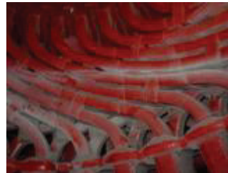
Figure 5: Widespread endwinding vibration and insulation abrasion