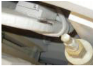
Figure 4: Loose block leading to bare copper due to abrasion