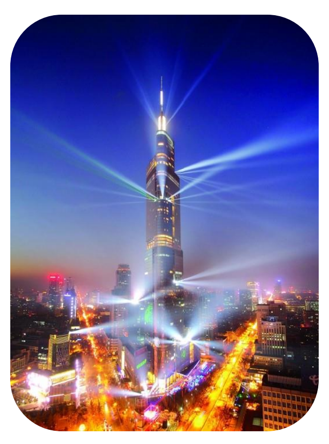
World Ranked 7<sup>th</sup> Highest Building