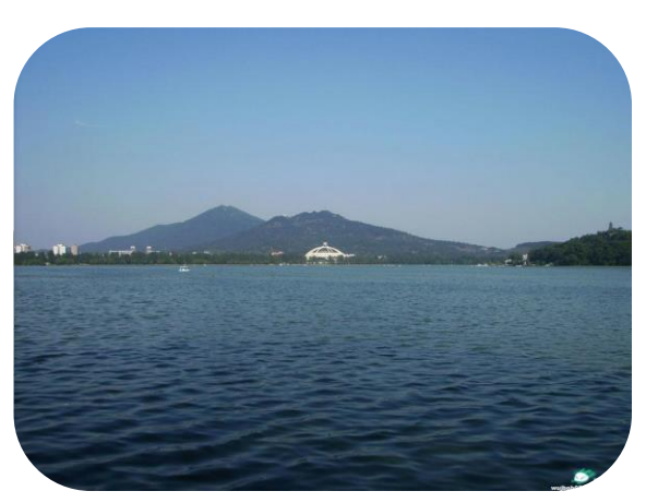
Xuanwu Lake (Imperial Lake, 600 years ago)