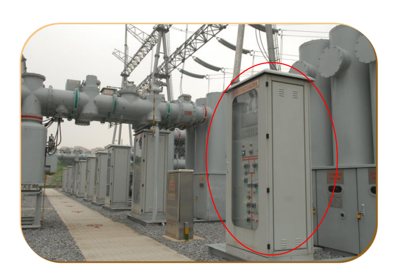
Outdoor Intelligent CB Controller